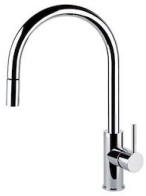
Mixer Tap Camillo